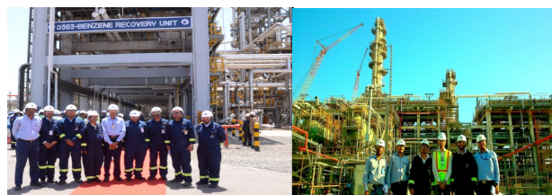
Plant Commissioning in May 2016 at RIL Jamnagar