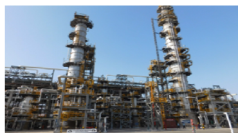
Benzene Recovery Unit RIL Jamnagar

Major application of the technology will be for the production of benzene lean gasoline from FCC Naphtha. The by-product of the process, benzene rich aromatics stream may be further purified in downstream fractionation units to get high purity benzene. The technology will soon become the need of the hour, in view of not only producing clean sulfur and benzene lean gasoline but also for efficient recovery of high value materials (like benzene) from alternative feedstocks such as FCC naphtha.