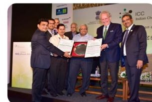
CSIR Technology Award for Innovation – 2014 & ICC Award for Excellence in Process Design – 2016