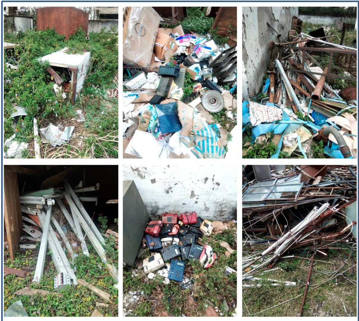
Figure 4: Images of e-waste from store yard of the institute