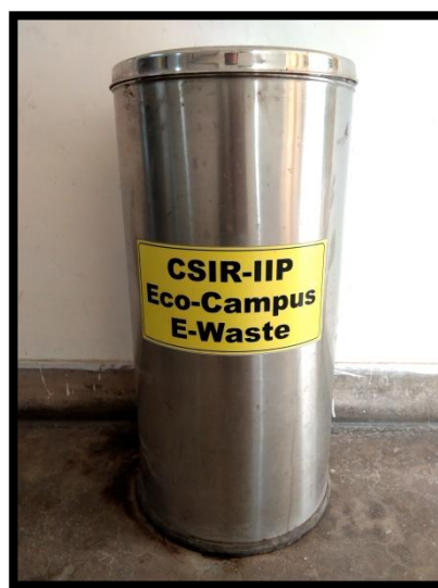
Figure 5: Separate dustbin for the segregation of e-waste in campus