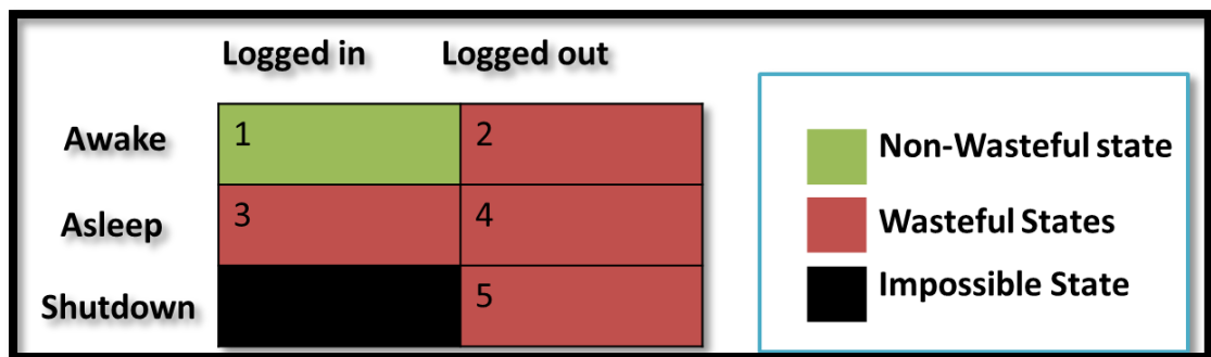
Figure 1: Five desktop computer energy states and their classification either wasteful or non-wasteful.

These states are presented in figure 1, which clearly tell us about the energy consumed in states from two to five considered as wasted because computers were not in active use in these states.