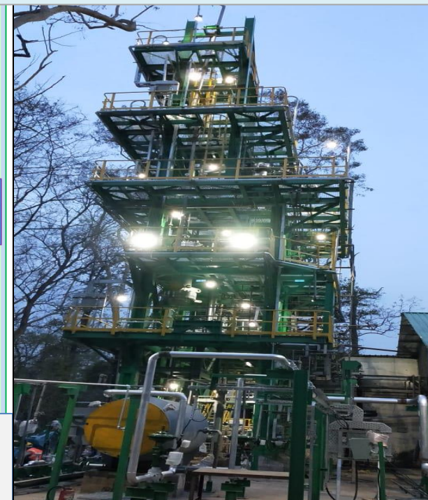
1 TPD pilot/ demo unit at CSIR-IIP for waste plastics to diesel